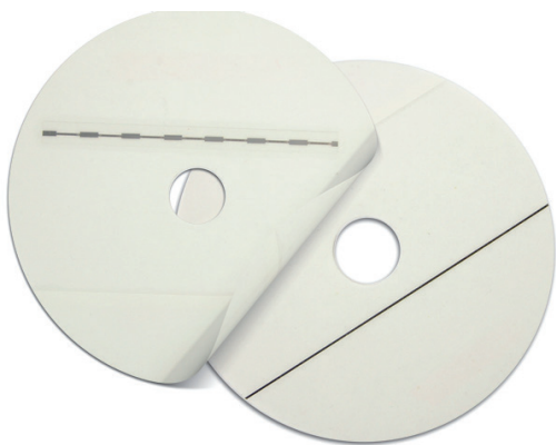
EM CD/DVD labels